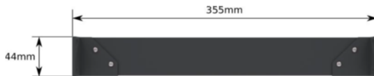
View - from above